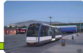
ULR 60 passenger tram ICE + Energy storage

Units of distance per one unit of Energy